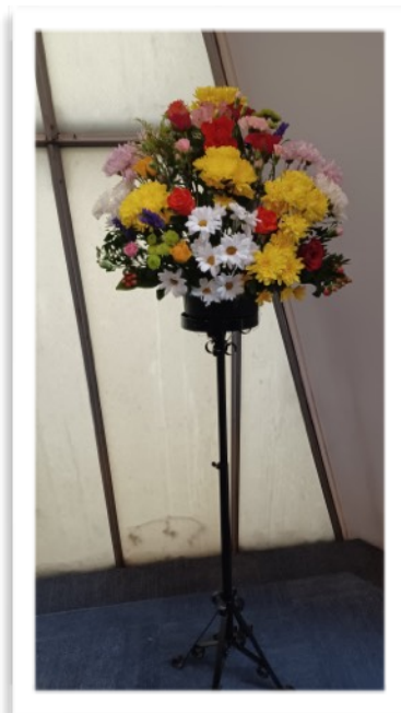
Flower arrangement, 5 th February