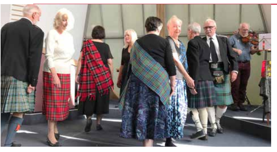
Strathspey being danced during the service

not cope with Dorothy's passport information once she reached the age of 100 as they only flag up the last two numbers. "When we went through Eurotunnel with Dorothy as a centenarian, the official looked puzzled and then told her 'According to the information on my screen you haven't been born yet."