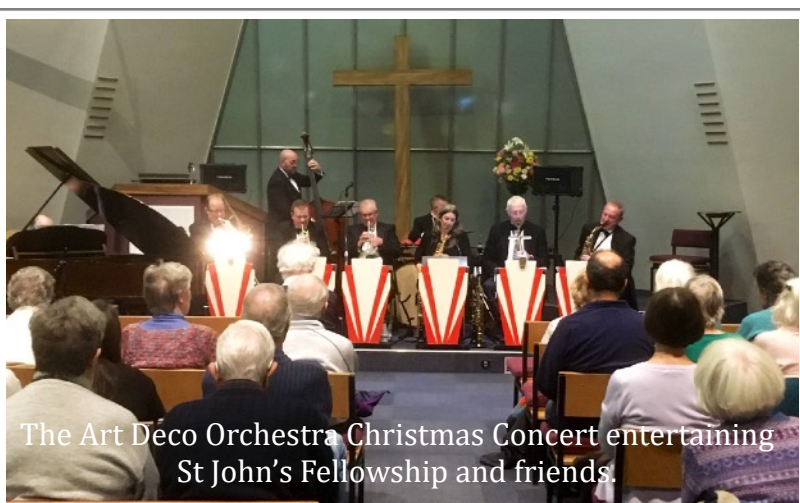
The Art Deco Orchestra Christmas Concert entertaining St John's Fellowship and friends.