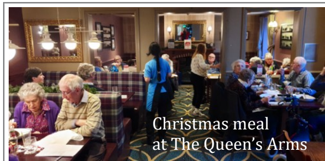
Christmas meal at The Queen's Arms