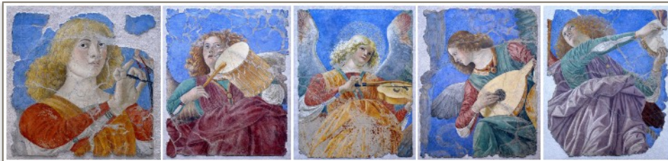
Musician Angels - Melozzo di Forli, The Vatican

The message of the angels of peace on earth is one that resonated deeply with Edmund Sears and still does today. The final verse says it all: